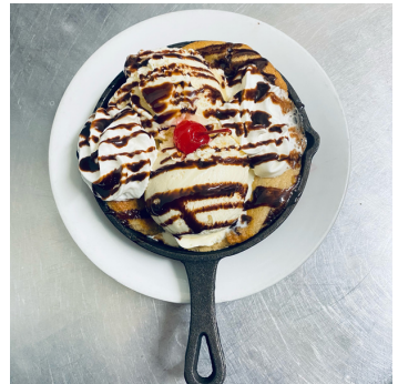
Cookie Skillet 5.49