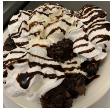
Brownie Sundae 5.49